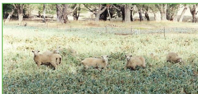
Gundagai lamb liveweight gain trial